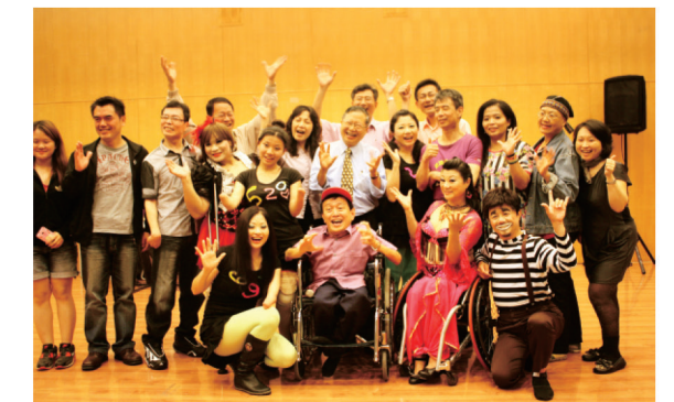
▶ Get close to arts Care for life Disabled Performing Group “Never Give Up, Create a Miracle”

The College of Humanities and Social Science keeps on developing. With the efforts of all KMU's members, the College will move forward to realize the goal that set up by KMU was founded. We hope the founding of the College can introduce brand new atmosphere to KMU in both social science research and humanities, and furthermore, to nurture medical professionals with the spirit of humanitarianism and social caring for our society.