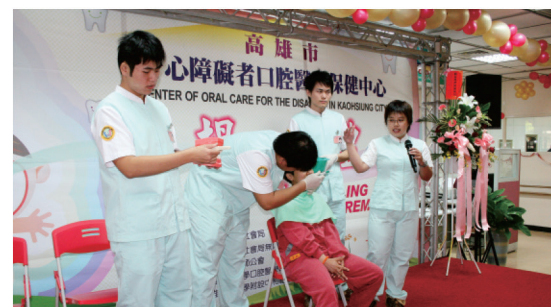
▶ Health Education Services by the Department of Oral Hygiene

The College of Dental Medicine includes the School of Dentistry and the Department of Oral Hygiene. It was the first domestic dental medical education institute of college scale in Taiwan, and advances toward the oral medical education of international standard. In teaching, the school of Dentistry stresses both clinical skills and knowledge of basic science to allow students to experience clinical conditions and develop expertise in both theory and clinical skills.