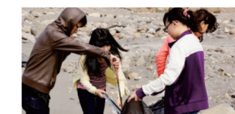
► Housheng Hall held a "Cleaning the Beach" Learning Event in CiJin District

In the future, based on the existing foundation, the GEC will promote quality general teaching modules to all general education curricula by holding workshops and activities for teachers, and enhancing citizenship nourishment through renovative teaching approaches to shape up a cultural milieu on campus. The GEC will help students learn from the "experience program," and strengthen teamwork, communication, negotiation, and altruism through practical activities so as to carry out knowledge and action at the same time. Finally, through the Academy of Life, official and unofficial courses will be connected, which will help students internalize what they have learned before. The GEC thus hopes to cultivate modern medical professionals with professional expertise, medical humanitarianism and a sense of citizenship in their mission of maintaining and improving human health and welfare.