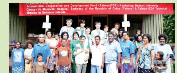
Solomon Islands Medical Mission Group