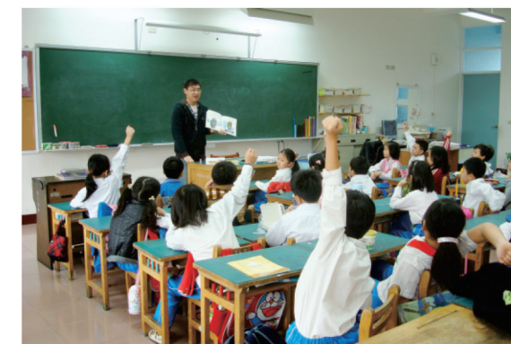
► Volunteering tutoring service for disadvantaged students

In order to equip students with five moral and intellectual aspects, KMU not only educates students with official courses to improve students' professional knowledge but encourages them to take part in sports and student association activities as well. In addition, KMU holds various cultural and artistic activities including academy of life since 2010, and "all freshmen as academic students" activity in 2013. By extracurricular learning activities, students are equipped with the humanities, citizenship, and diverse abilities, including moral, intellectual, physical, communitarian and aesthetic abilities. From 2011, KMU has received the grants of "Cultivation of Citizenship of All School Students" from the Ministry of Education over the past three years. The student associations are developed very well. From 2010 to 2014, KMU's student associations and student council have been assessed as Excellent by the evaluation of nationwide student associations and student councils.