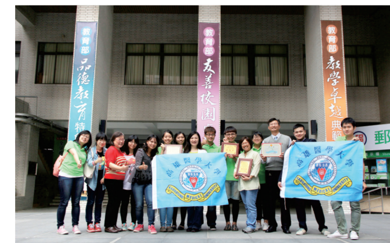
► KMU's student associations won the award of Excellence and Golden Award in the contest of the national student councils.

KMU is devoted to providing students with a good learning environment and hopes to create a campus full of prosperity and creativity, by which students can wander between learning and joining extracurricular activities to fully enjoy humanistic education and professional knowledge scenarios offered.