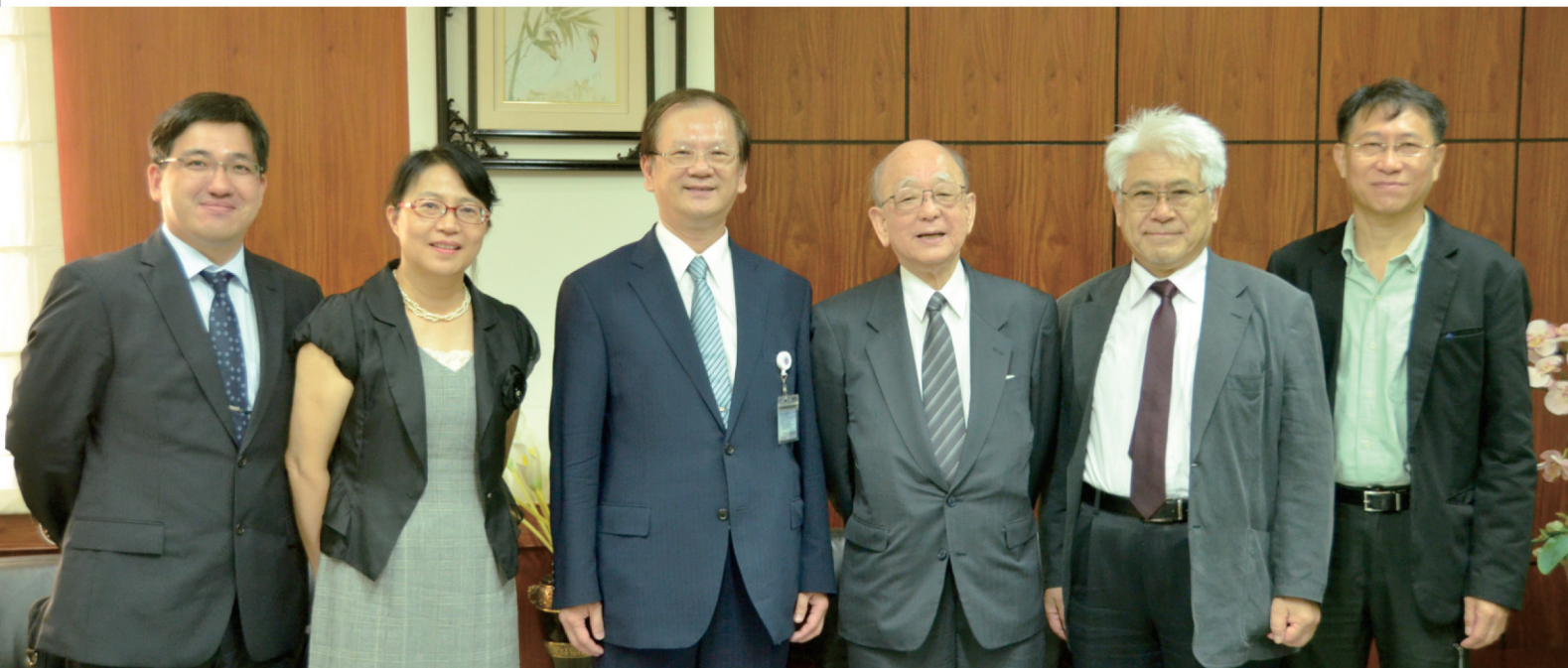
▶ The Winner of Nobel Prize in Chemistry, Professor, Akira Suzuki (third from right), visited and lectured in KMU.