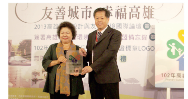
► Excellence in Barrier Free Environment Evaluation, Kaohsiung City