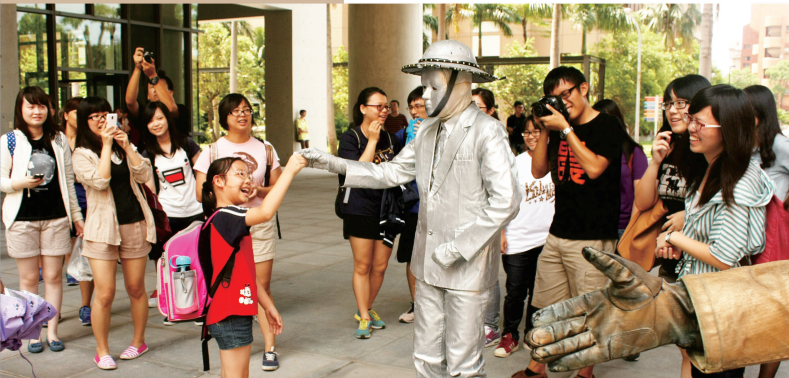
▶ Living Statue, “Living Statues on Campus”

The College was founded on the 1st of August 2012, integrating the Department of Psychology (Undergraduate and Master's Programs), the Department of Medical Sociology and Social Work (Undergraduate and Master's Degree Programs), the Graduate Institute of Gender Studies and some other units. Non-departmental instructional units were reorganized: Physical Education Division and Language Education Division were upgraded to become the Center for Physical Education and the Center for Language and Culture respectively. Likewise, the Division of Humanities and Social Sciences was to become the Center for Humanities and Arts Education while the division of Natural and Applied Sciences was turned into the Center for Fundamental Science Education.