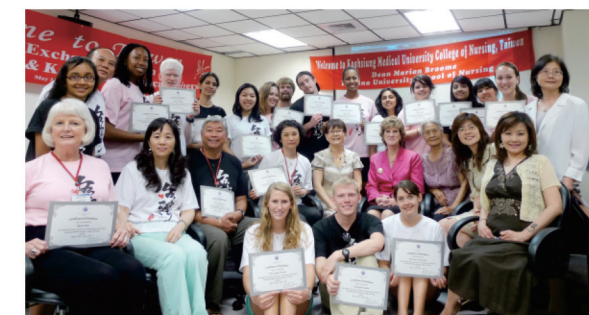
► Teachers and students from University of Georgia, U.S.A. , one of our sister schools, joined in exchange programs organized by the MSN Program.

As for the outlook, in order to secure its educational accountability and cultivate professionals in line with the demands of the nation and society, the College will persevere with the following endeavors: Promoting course reforms, developing Interprofessional teaching in a long-term care enhancing research capacity, promoting industry-university cooperative research projects; fostering student recruitment and counselling, caring for disadvantaged and high-risk students, strengthening career counselling, increasing students' employment competency, expanding international academic exchange and collaboration, and finally, enlarging faculty and students' international perspective and competitiveness.