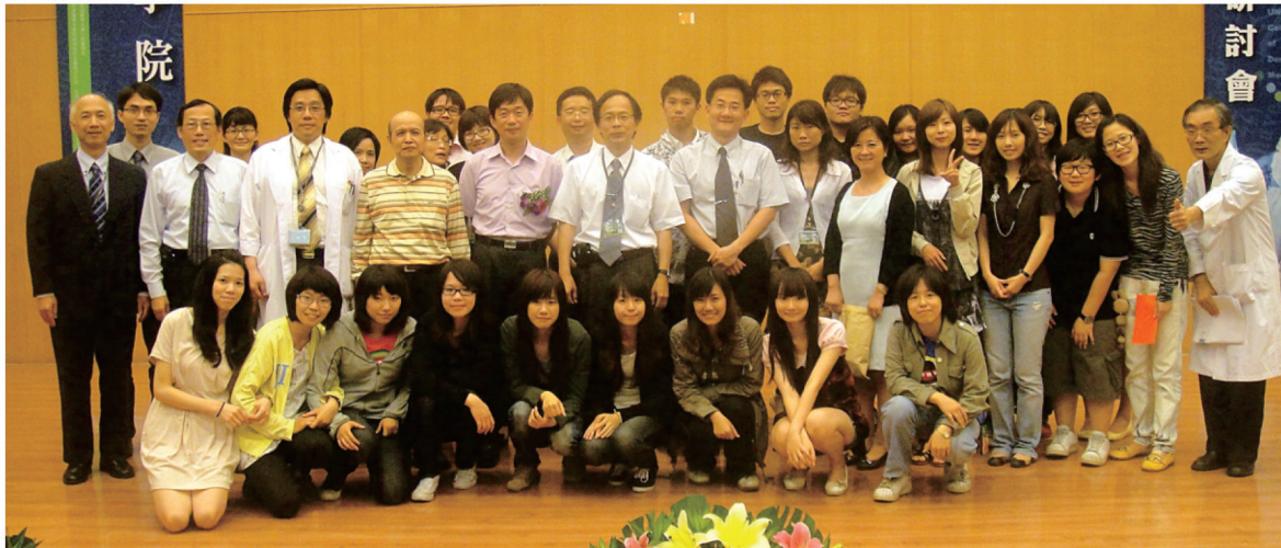
▶ The Research Day of the School of Dental Medicine The Third Academic Conferences