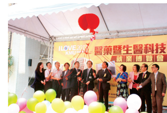
▶ Employment ability— Medical and Biomedical technology career fair

We hope that by implementing the strategies above, we can maintain our excellent traditions in medicine and healthcare and cultivate professional specialists meeting the needs of national healthcare and the medical industry.