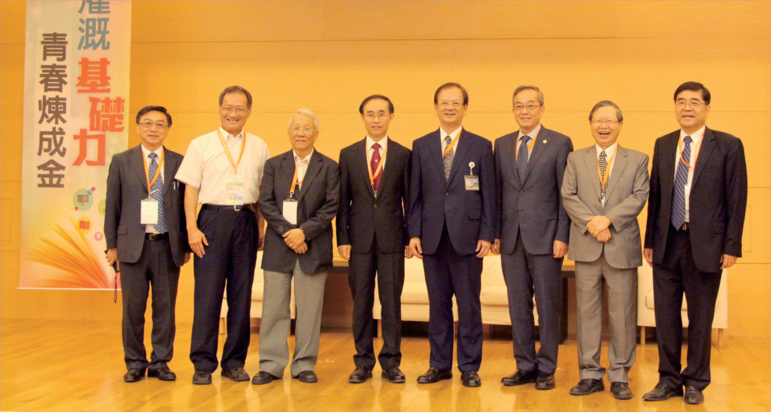
▶ “The forum of basic abilities” held by KMU, a group photo of honored guests