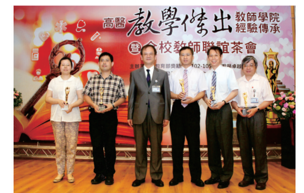
▶ Teaching competence— teachers awarded by outstanding teaching