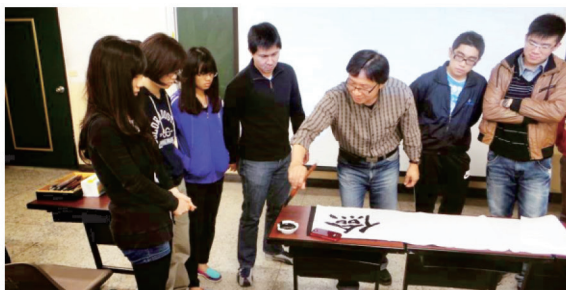
► Chuanxi Hall held a "Calligraphy" Learning Event

Enrolling all freshmen incoming as members of KMU Academy of Life in 2013, with core indicators of education "Gratitude, Enthusiasm, Respect, Courtesy, Esprit de corps, and Caring"