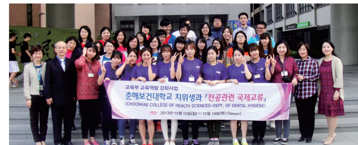
▶ Choonhae College of Health Sciences, Korea, international academic exchange.