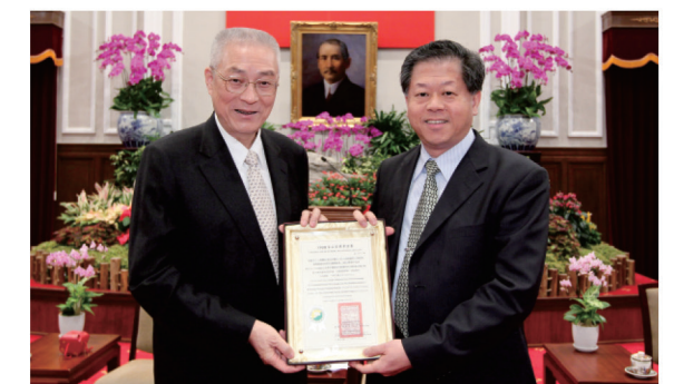
► SNQ—A Unique Medical Service of Newly-emerging Environmental Disease

Kaohsiung Municipal Siaogang Hospital carries out policies of Kaohsiung City Health Department, fulfils municipal hospitals' social responsibility, keeps along with the medical strategies of the medical system, and undertakes KMU's promoting tasks. In the future, it proposes to build a new building for improving medical space and equipment for cancer, cardiovascular disease, invest in advanced medical equipment, develop new medical skills, plan a more friendly medical environment, build up a medical-level municipal hospital with high quality, high efficiency, and coziness, offer Kaohsiung citizens the best healthcare service, become a model of private management of a public hospital, extend KMU system's excellent medical services, and provide clinical teaching and research models for community hospitals.