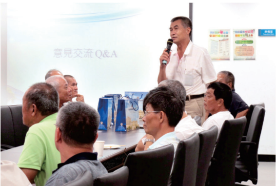
▶ New Cijin Hospital Cijin District Medical Demand Symposium

Therefore, KMCH will provide medical services by taking Cijin neighbors as "good neighbors" to bring convenience to Cijin citizens when they go to the hospital, and meanwhile, they can receive high-quality healthcare. With the help of excellent medical skills and good quality of the medical group from the medical center, Cijin hospital will be devoted to providing medical services in general medicine, family medicine, preventive medicine, acute health care and community health. In the future, it will develop the subacute or chronic healthcare institutes so as to establish a holistic healthcare net.