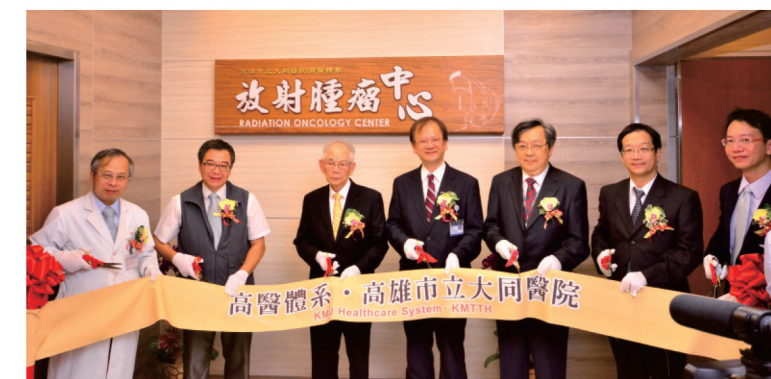
► Opening ceremony of the Radiation Oncology Center