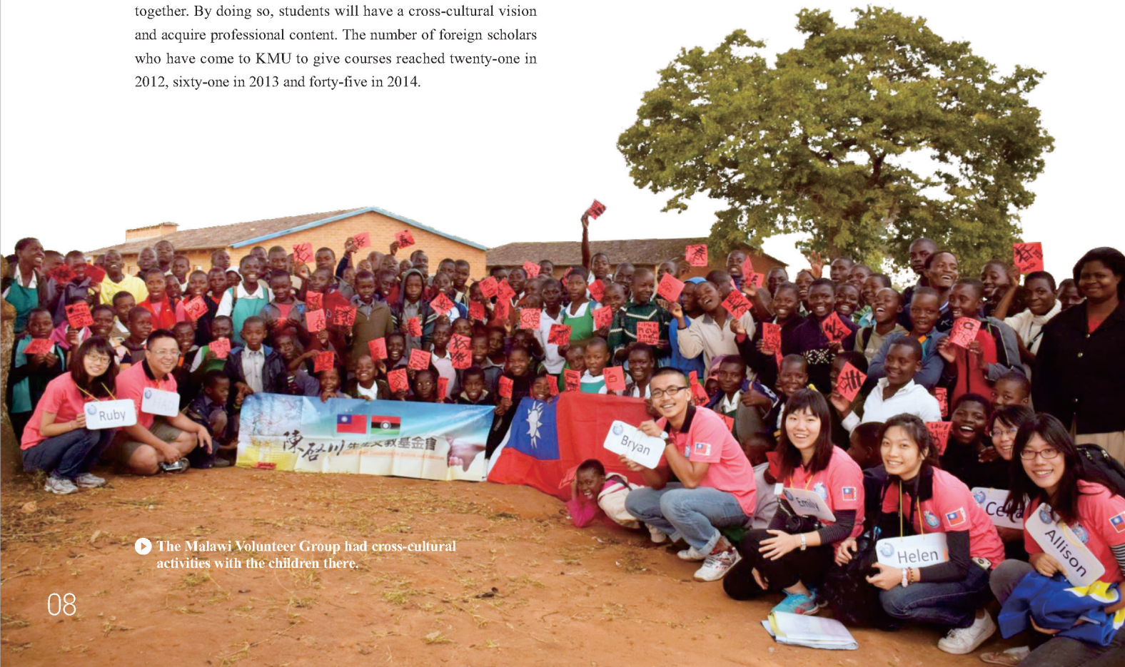
▶ The Malawi Volunteer Group had cross-cultural activities with the children there.

Master's and Ph.D. programs have uploaded their syllabuses in English. The approach to awarding teachers lecturing in English and encouraging them to give courses in English has been revised. During the past three years, the number of courses lectured in English were 94 in 2012, 102 in 2013 and 100 in 2014.