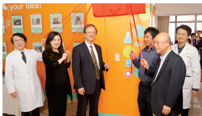
► Entrepreneurship Corner - Synapse Opening Ceremony

By combining biotechnological medicine and medical instrumentation to propel industry-university cooperation, KMU hopes to strengthen links between academic research and development and innovative industries, thereby transforming academic energy into industrial profit.