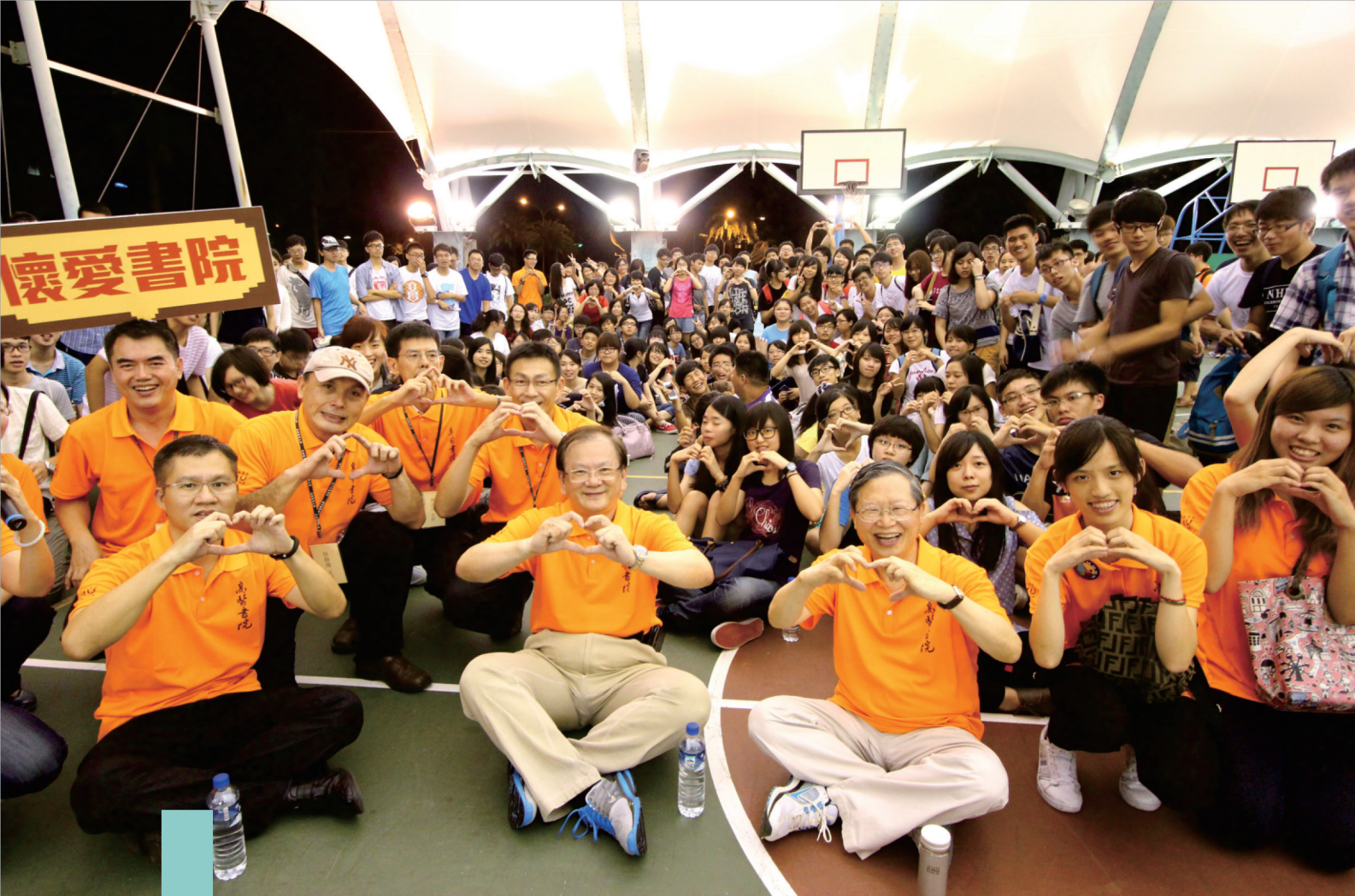
► KMU Academy of Life held orientation activities and gala in the Sports Dome -- The activity "Passing on Love"