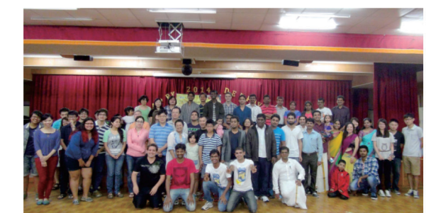
▶ International students celebrated Diwali, Hindu "festival of lights" in KMU