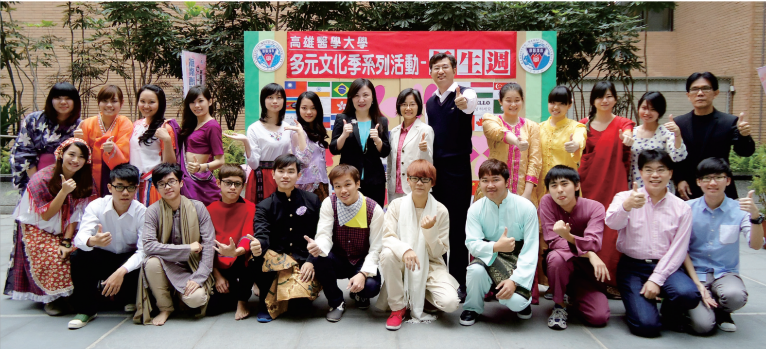
► The Opening of the Multicultural Season

KMU emphasizes student counseling and endeavors to promote students' diverse and balanced development. By doing so, KMU hopes to cultivate a healthcare professional with professional attitudes, virtues, and social care. Therefore, the Office of Student Affairs counsels students with the idea of "Total care, Active Service" and adopts the "4H" (Health, Humanity, Harmony, Hope) Plan as its working prospect.