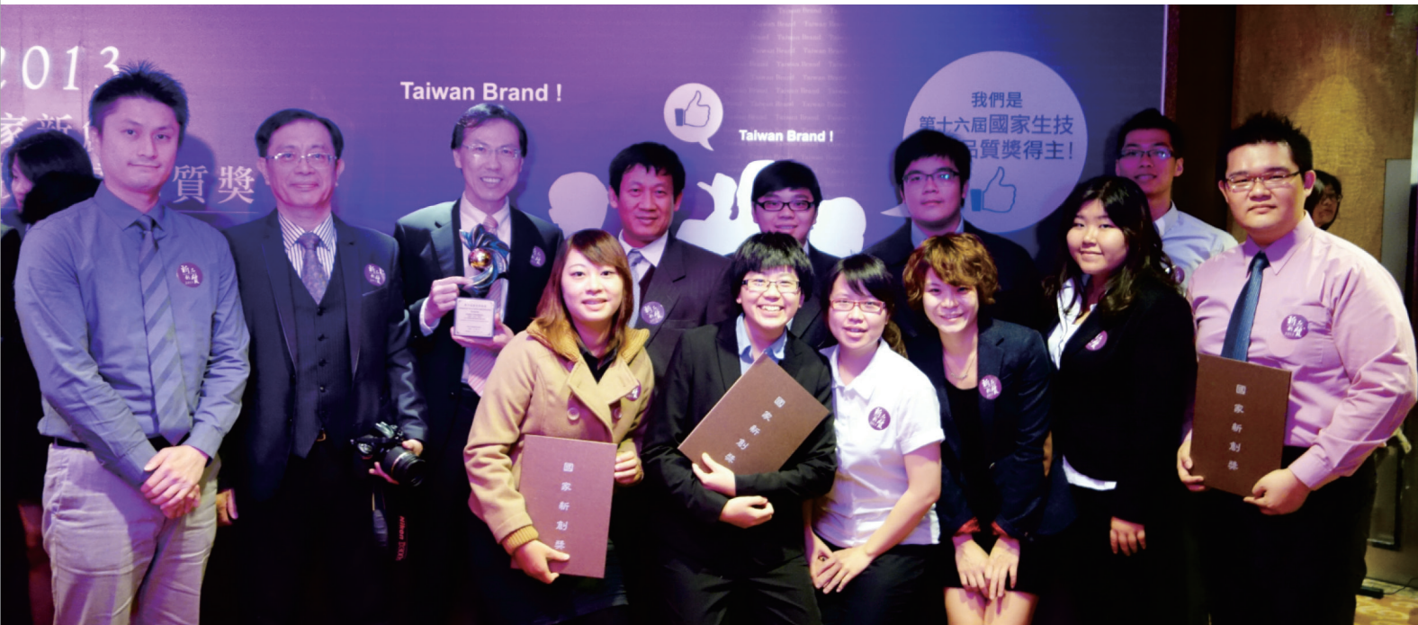
► The photo of the 10th National Creativity Award's winners