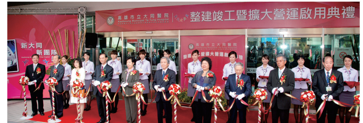
► Accomplishment of Reconstruction cum expansion of operation ceremony—ribbon-cutting

KMU was entrusted to operate Ta-Tung Hospital by Kaohsiung City Government in 2009. The hospital is the first ROT municipal hospital in Taiwan, and the third KMU affiliated hospital. The hospital passed the New Teaching Hospital Accreditation within one year of its establishment, and was certified "Excellent" in New Hospital Accreditation at the same year by Taiwan Joint Commission with the record for shortest time to win this award in Taiwan. In the second year of operation, the hospital began to gain profit, building up the model of private management of a public hospital. In 2011, the hospital won the ninth session of Private Participation in Public Construction Golden Thumb Award, Private Team First-Rate Award and Public Welfare Award of the Public Construction Commission, the Executive Yuan, which has become the model of promoting civil people's participation in public construction projects.