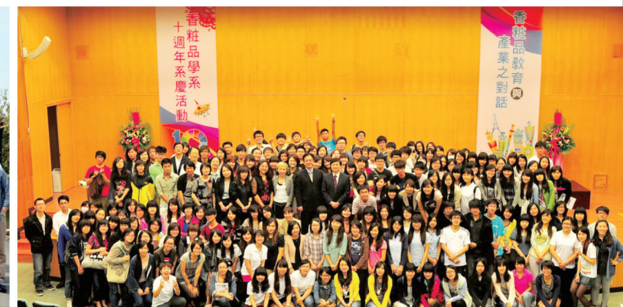
▶ Cosmetic Education and Industry Conference