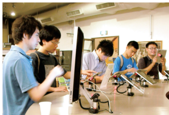
▶ Integration of teaching resources Touchpanel-based experiencing area

In addition, by creating a cloud service campus, teaching resources can be integrated. By sharing regional teaching results and resources, all educational institutes in the region can benefit via enhancing the teaching quality and the function of supporting systems. In addition, the self-assessment of educational institutes will be established so as to create an excellent specialist-cultivating campus and to improve the school-running quality. The following are the strategies of cultivating specialists: