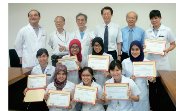
▶ The visit of students from the Department of Dental Medicine, University of Malaysia

With the help of different professions in research and teaching fields, the College of Dental Medicine will organize research and teaching teams in the college to operate multi-perspective integrated teaching research in terms of compatibility and complementarity.