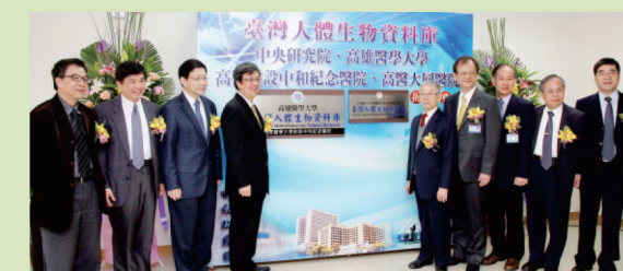
Taiwan Biobank opening ceremony

The hospital will continue developing outstanding medical characteristics, carry out a learning-center teaching module, award outstanding research and publications, elevate patients’ safety and medical quality, insist on medical ethics, take social responsibility, protect Kaohsiung, step out of Southern Taiwan, cross the Taiwan Straits, and win more honors for Chung-Ho Memorial Hospital.