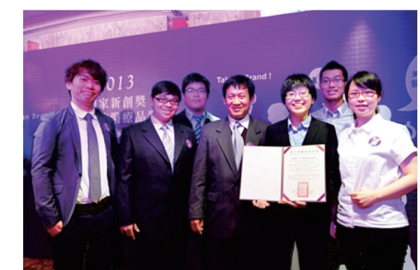
▶ Second Place in Student Group of the Tenth Session of the National Creativity Award