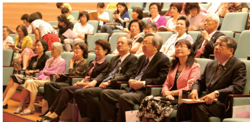
► School of Nursing 40 th Anniversary