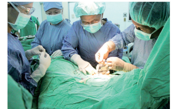
► Intraoperative radiation therapy for breast cancer

Ta-Tung Hospital executes national and city governments' medical hygiene policies and undertakes the responsibility of a municipal hospital. It provides innovative patient-centered care delivery and environment by implementing APP, registration mobile counters, automatic payment machines, automatic prescription refill machines and etc. to offer humanitarian services. In addition, in order to carry out social responsibility, the hospital invests the most resources to community construction, which elevates the public's healthcare management ability. The achievement was recognized by the Global Views Magazine and nominated for the Tenth Edition of Social Responsibility Award, which make the hospital highly recognized in community health promotion and construction. According to ROT performance guarantee, the annual premium given to the city government is up to 30 million NTD