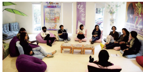
► Huaiai Hall held a "Listen to Her Storytelling" Learning Event in Kaohsiung City's Women's Building