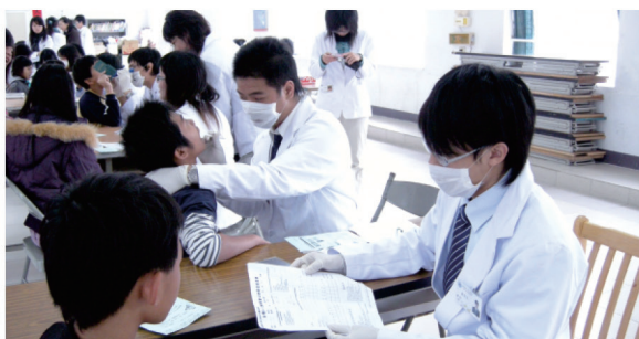
▶ Service of Dental Examination