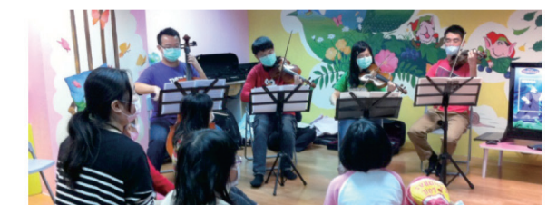
► Students joined Making and Realizing A Dream Project under the Cultivating Citizenship Competence grant, and held "I See You" storytelling activity to encourage sick children