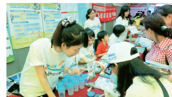
► Kaohsiung Healthy City Activity—Prevention and Promotion of Occupational Hazards and Age-Friendly Promotion

Because the hospital locates beside the three main industrial areas in Kaohsiung, the hospital undertake the responsibility to offer medical care for the labors there. The hospital has set up center of environmental and occupational medicine, department of integrated occupational diseases, physical examination center, and department of family medicine to promote workers' health, provide integrated healthcare service, and engage in promotion of occupational health. It won the SNQ in the Featured Specialty Section of Hospital Category - Integrated Workplace Health Promotion Service award