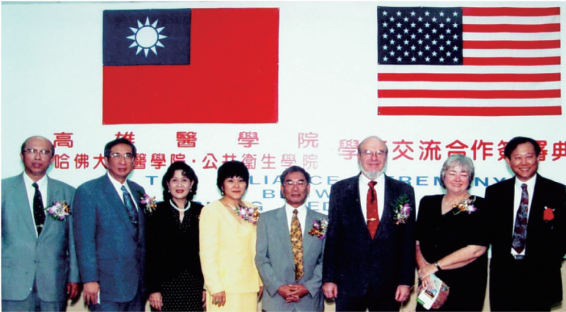
KMC and Harvard Medical School & Harvard School of Public Health organized an interchange cooperation signing ceremony.