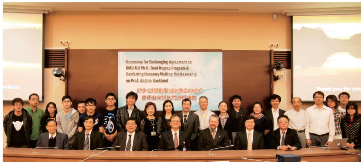
▶ Signing Agreement on Double-degree with Uppsala University, Sweden