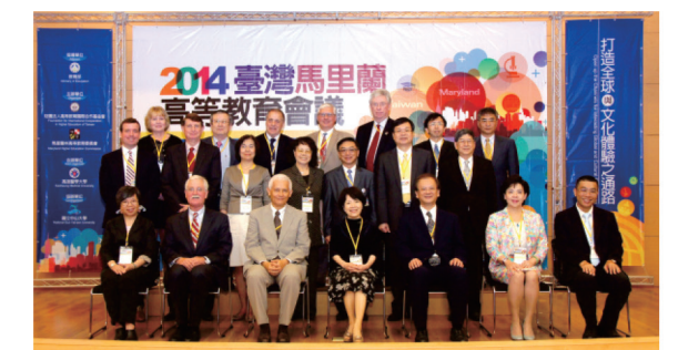
▶ Taiwan-Maryland Conference on Higher Education 2014