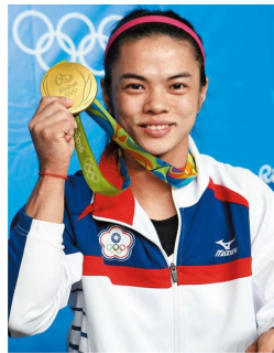
Shu-Ching Hsu Two Consecutive Olympic Weightlifting Gold Medalist (2012&2016)